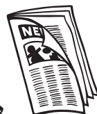
All kinds of paper and cardboard