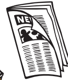
All kinds of paper and cardboard